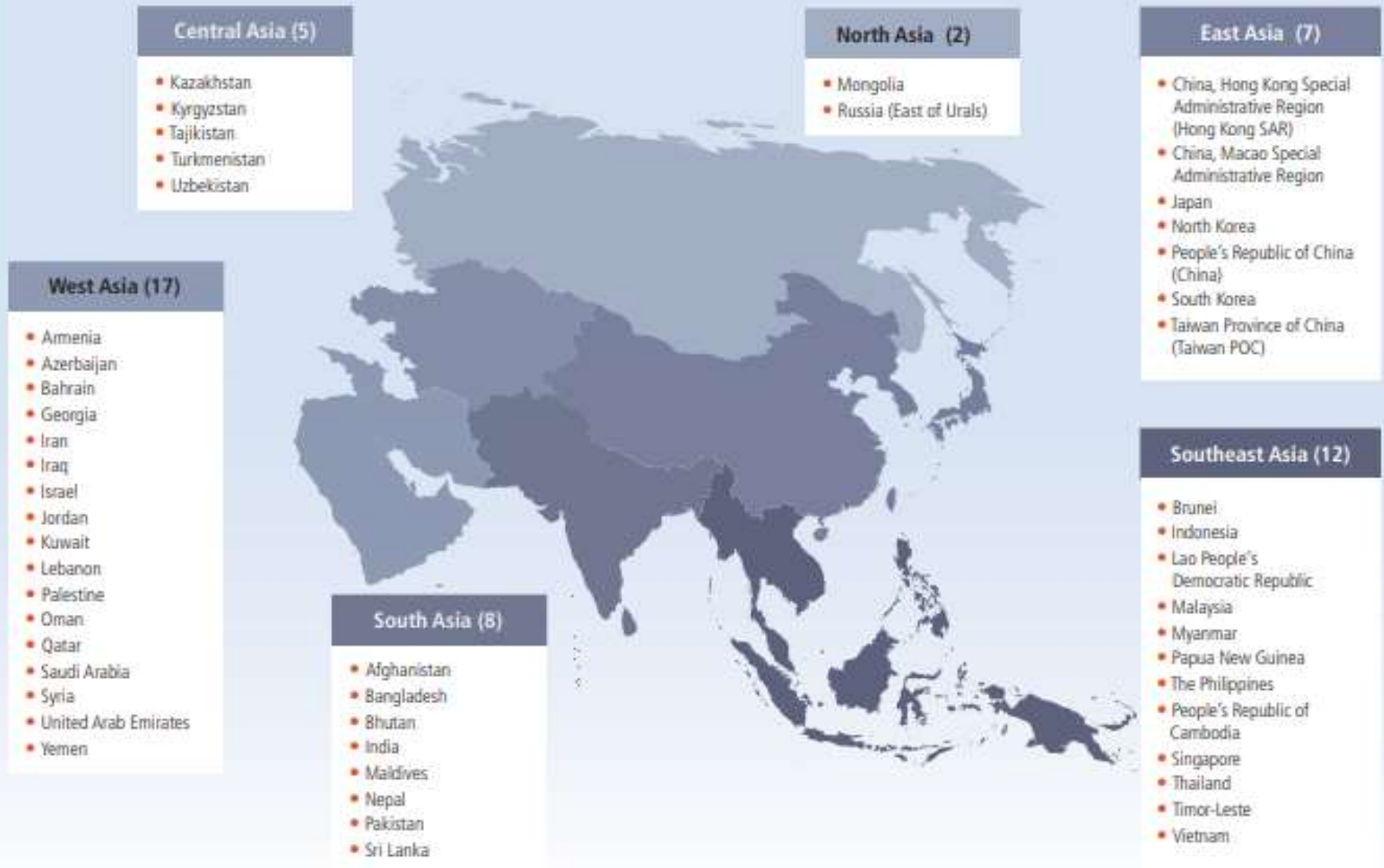
Figure 24-1 | The land and territories of 51 countries/regions in Asia. Maps contained in this report are only for the purpose of geographic information reference.

The land and territories of 51 countries/regions in Asia. Maps contained in this report are only for the purpose of geographic information reference.